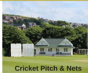
Cricket Pitch & Nets