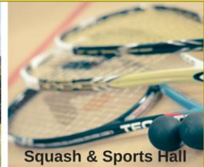
Squash & Sports Hall