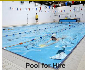
Pool for Hire